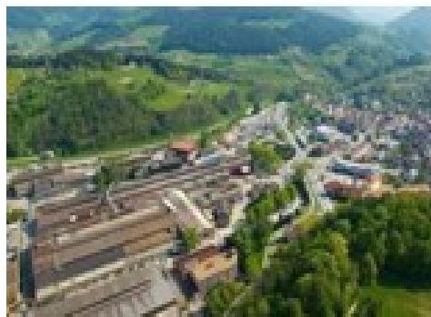
Ravne na Koroškem, 2010