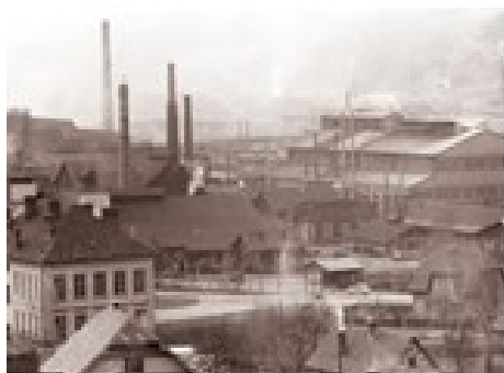
Ravne na Koroškem, 1962